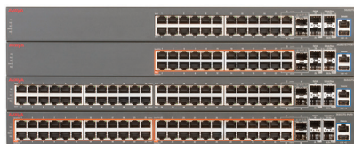
ERS 3600 Stackable Chassis

businesses the flexibility to satisfy all common deployment scenarios, with the added advantage of an easy transitioning between the two.