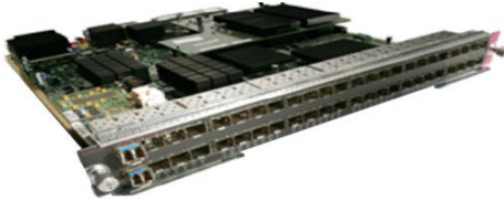
Figure 5. 6800 Series 48-Port 10/100/1000 Interface Copper Module WS-X6848-TX-2T/2TXL