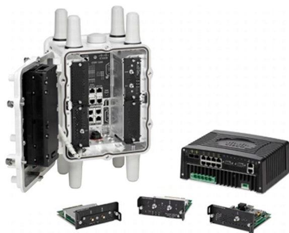
Figure 1. Cisco 1000 Series Connected Grid Routers

The Cisco CGR 1000 Series includes two platforms, shown in Figure 1: The Cisco 1120 Connected Grid Router (CGR 1120), which is designed for indoor deployments; and the Cisco 1240 Connected Grid Router (CGR 1240), which is a weatherproof router in a NEMA Type 4 enclosure for outdoor deployments.