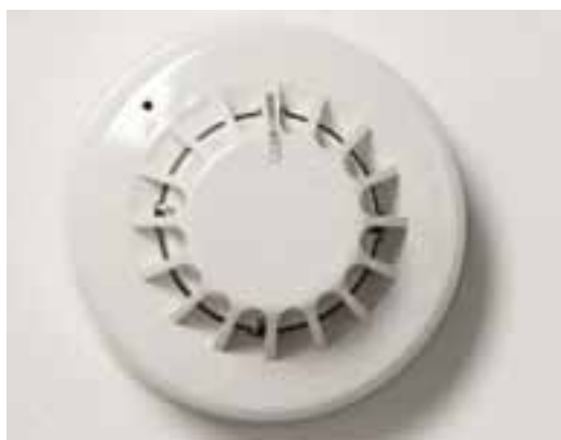
Addressable Sensor, Multi-Mode Heat (UCAH330)