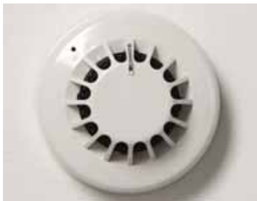
Addressable Sensor, Opto-Heat (UCAPT340)