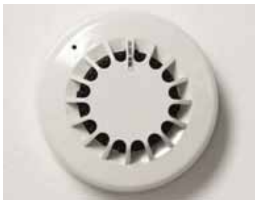
Addressable Sensor, Optical (UCAP320)