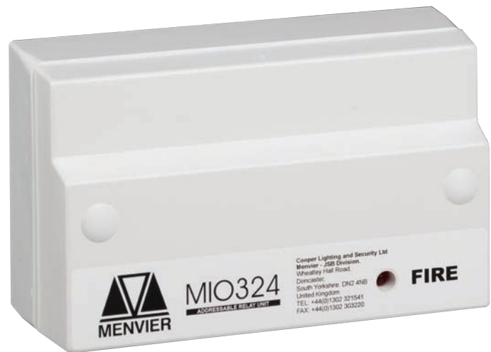
MIO324 3 channel I/O unit