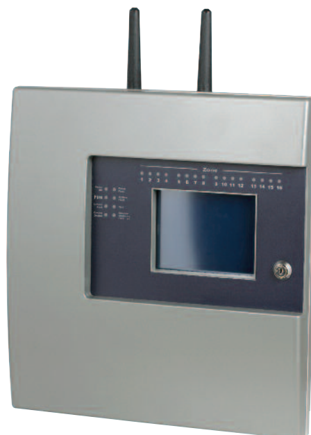
CW9000 - Wireless Control Panel