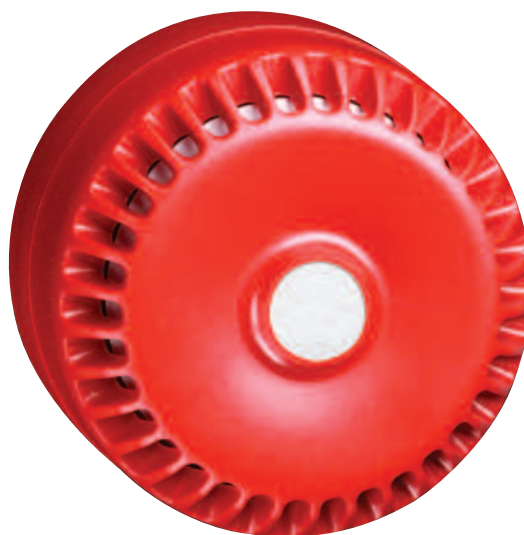
FX002 low profile surface sounder, red